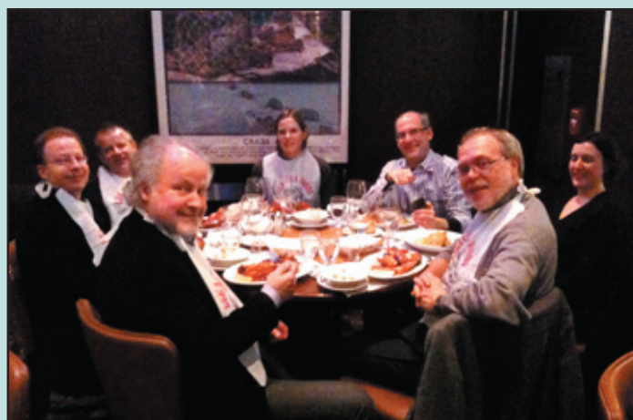
Members of the Berlin Philharmonic Wind Quintet share a crab dinner with the entire David Rowe Artists staff following their Boston debut.

The Berlin Philharmonic Wind Quintet will return for tours in October, 2010 (fully booked) and October 2011 (just getting started).